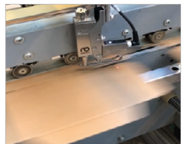
Application of SpeedUp creaser liquid to the fold line