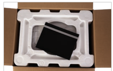
Correct dimensions for precisely fitting insert