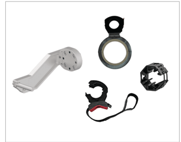
UR+ Integration Kit