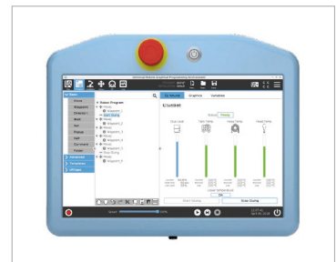
GlueBot URCap Software