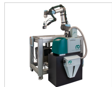
Cobot with adhesive application system and automatic filling