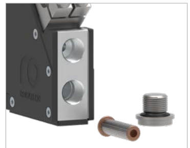
Integrated adhesive filter