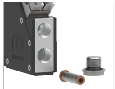
Integrated adhesive filter