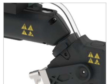
Fully insulated plug coupling eliminates thermal bridges