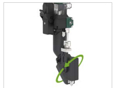
Rotatable plug coupling for easy installation