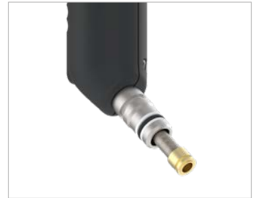
Filter integrated in the plug coupling