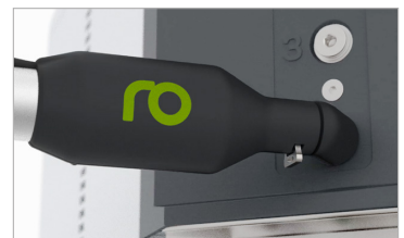
PrimeConnect plug coupling