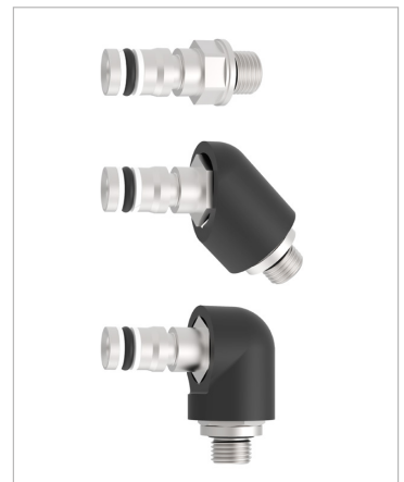
Plug-in screw connectors 0°, 45°, 90°