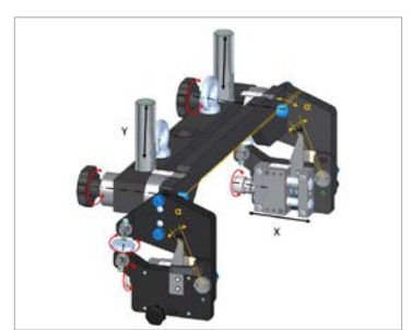
Optional mounting bracket simplifies positioning