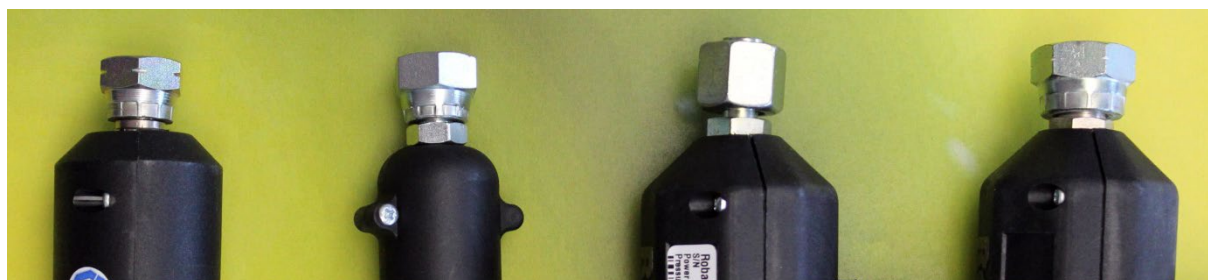
NW 8 / Type T