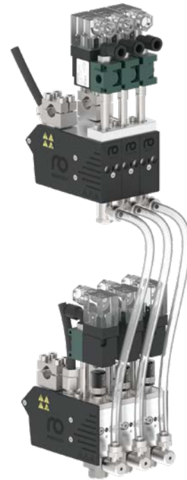
The Aero application head delivers precise, repeatable swirl application of high edge accuracy