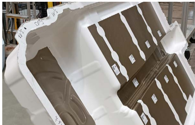
Mica plates of different sizes can be glued using Aero without changing the nozzle, despite varying amounts of adhesive being required.