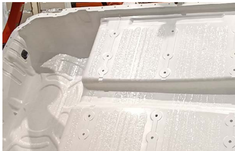
Precision, repeatability, and edge accuracy are hallmarks of quality in swirl application