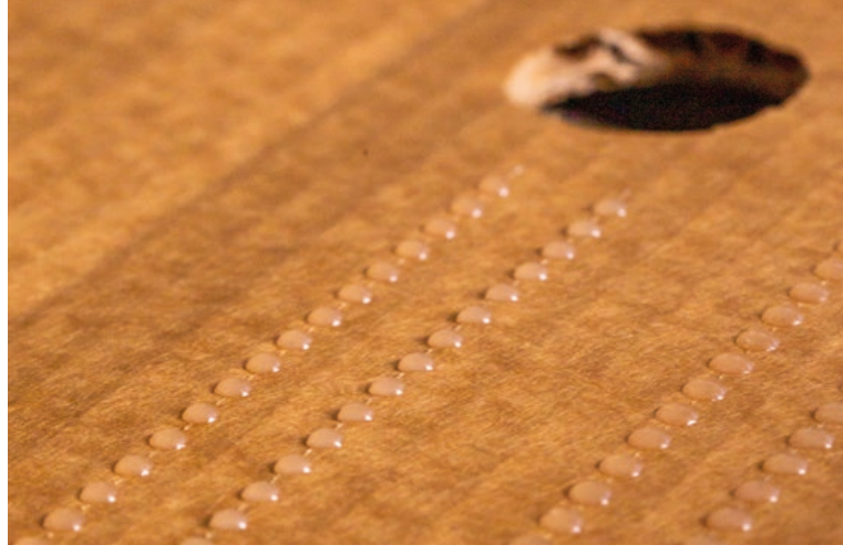
Stitching: Adhesive-saving dot application replaces bead application