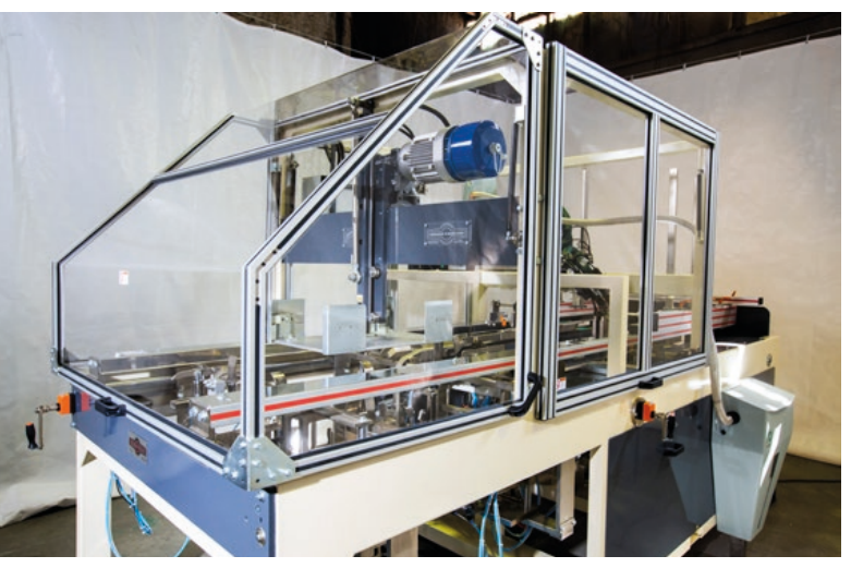
Tray former with GlueFill granulate container (right) of the filling system

DMS Osman Çubuk Makine Ltd. Şti. based in Izmir, Turkey, mainly manufactures tray formers in standard and special designs for erecting and gluing cardboard boxes for the food industry.