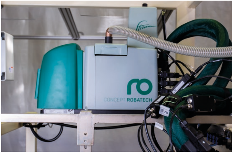
Concept Stream melter with RobaFeed automatic filling system