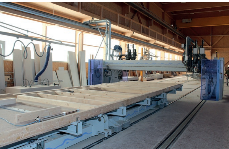
View of the entire system in the new production hall of Krattiger Holzbau AG in Amriswil.