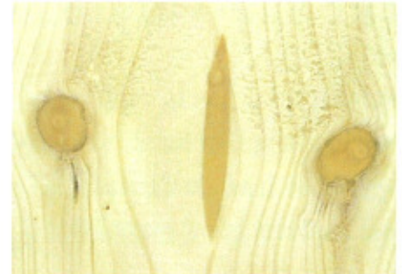
Repaired in 30 seconds