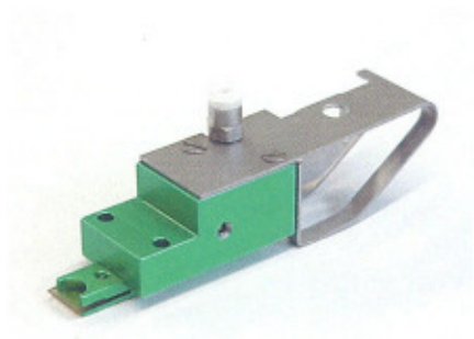
ECXMKS: 16 mm bracket and nozzle cover slider